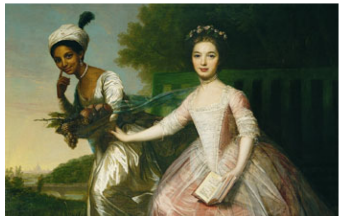
Dido Elizabeth Belle and her cousin Elizabeth Murray, anonymous artist, circa 1775.

Throughout the eighteenth and nineteenth centuries, scores of mixed people returned to Europe in search of fortune or family. Some proved