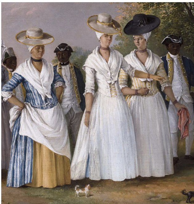
Detail, Free Women of Color, their Children, and Slaves in Dominica, Agostino Brunias, circa 1770-1773