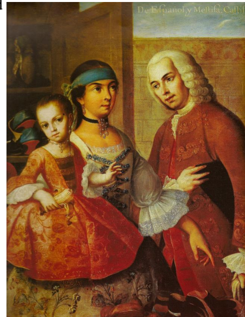
A mixed-race merchant family in colonial Mexico, Miguel Cabrera, 1763

Given the absence of any law restricting mixed